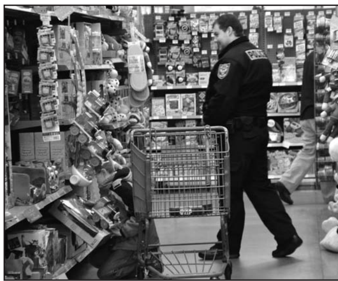
The adults who take the kids shopping get almost as much out of the experience as the children, who get to walk away with lots of presents.