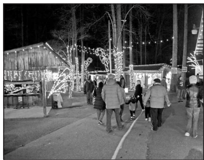
The "Mountain Country Christmas in Lights!" will continue through the end of December

According to Thomason, the light show has been a bigger success than anyone could have